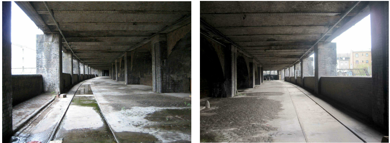
JACK ARCHED LID TO LONDON ROAD - This significantly contributes to the character of London Road and is generally to be retained and repaired.